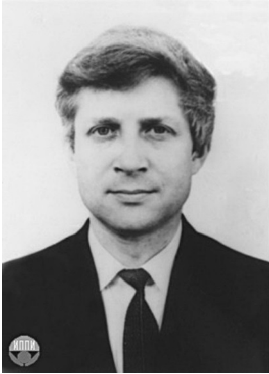
Fig. 1. Academician Nikolay Semenovich Kardashev, the official photo.

man 2013) or to constrain the evolution of intelligent observers (Carter 2008, 2012, Gleiser 2010). Kardashev's classification relies on Copernicanism for the underlying assumption that both the increase in energy consumption and the overall resources in the astrophysical environment are in general typical for the universe at large; some advanced exceptions to this will be considered below.