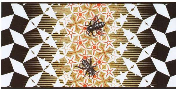
Fig. 2. A metaphor of the adaptationist solution to Fermi's paradox: emergence of complexity crowned by society (of social insects!) from the simple pattern, followed by reverting to simpler, but more stable forms (imagine the time flowing along the added horizontal axis). This is a section from the three-color woodcut Metamorphosis III which Escher finished (after considerable delays and even reluctance, as described in his diaries) in 1968. The metaphor is limited by the fact that the final state of the direct adaptation is not the mirror-image of the original pre-intelligence state ("evolution doesn't repeat itself").

tation ("crocodiles returning"). The second transition is much slower and might be occasionally interrupted or arrested; yet, the general trend toward return to direct adaptation is inescapable. This bifurcation is, in this view, tantamount to extinction of the original intelligent species, and its remains are gradually submerged into the general astrobiological "noise" of the Galaxy. The transient nature of the phase of technological adaptation constitutes the bulk of the "Great Filter" explaining the silentium universi . A colorful metaphor of the rise and fall of such advanced technological communities can be found, for instance, in a piece of the 1967-68 woodcut Metamorphosis III by great M. K. Escher (Fig. 2).